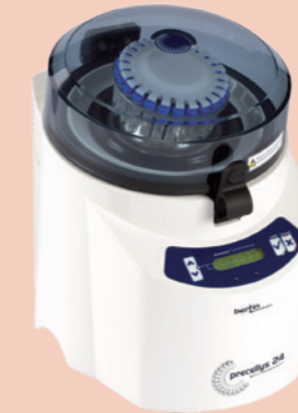
Precellys® 24 for high throughput