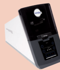
Minilys® for personal use