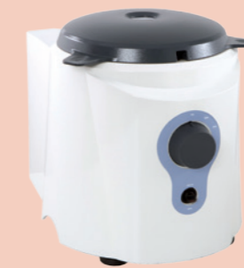
Cryolys® for sensitive molecules