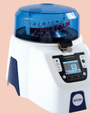
Precellys® Evolution Super Homogenizer