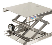
Stainless Support Jacks