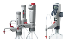
Bottletop Dispensers & Burettes