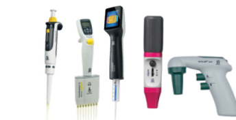
Pipettes & Pipette Controllers