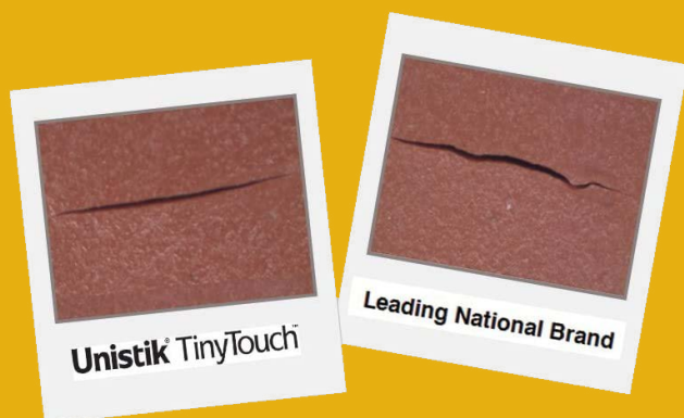
Image depicted shows magnification of incisions made in silicone comparing TinyTouch versus a leading national brand (2013).