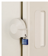
Standard keyed door lock and integrated padlock hasp (padlock optional)

Panasonic designed compressors are specifically used for storage applications in a laboratory environment.