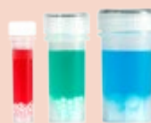
Lysing kits consumables