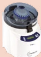
Precellys® 24 for high throughput