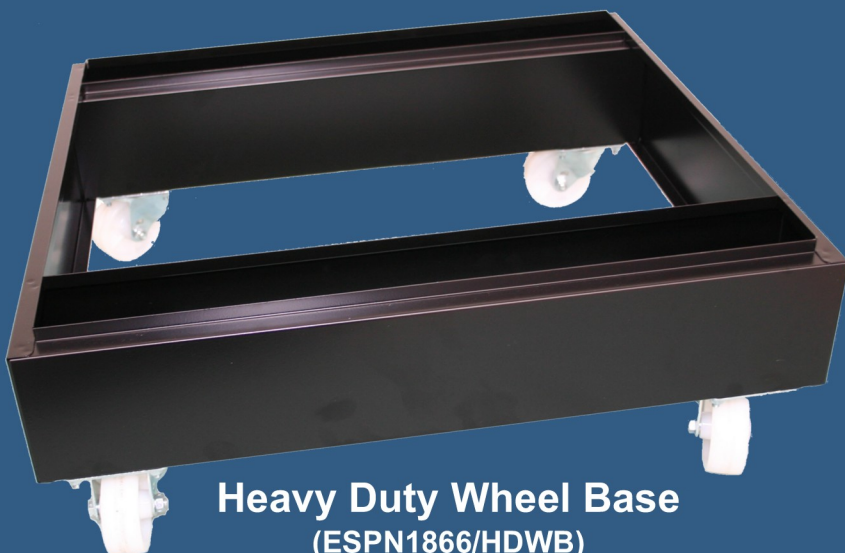
Heavy Duty Wheel Base (ESPN1866/HDWB)